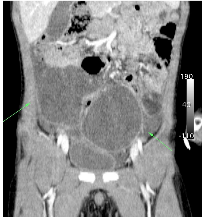
Figure 1: Computer tomography findings for mesenteric cyst. Bilobular cystic mass with dense content in ileal mesentery.

Informed consent was received from the patients' parent.