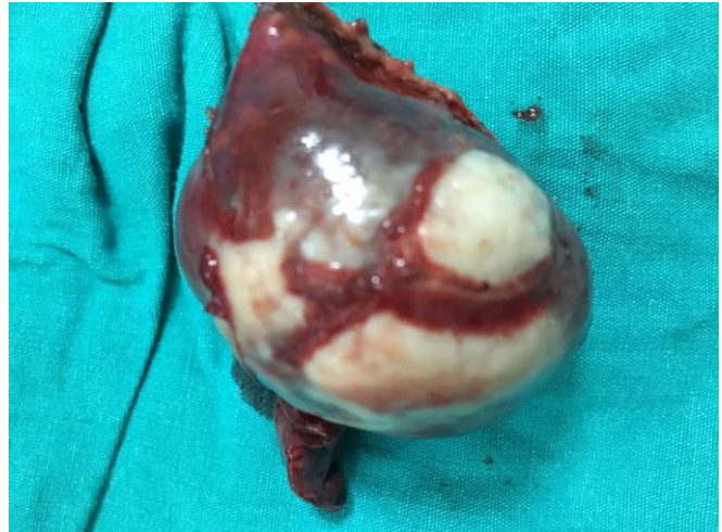
Figure 2: Appearance of the excised lung hamartoma.

(58%) were diagnosed with solitary pulmonary nodules; 7 (29%) with a mass in the lung (Figure 1); and 3 (13%) with a metastatic lesion. In 71% of the cases the diameter of the lesions was less than 3 cm. The lesions were localized in the right lung in 16 cases and in the left lung in 8 cases. While 17 lesions were peripherally located, 7 lesions were centrally located. Three patients underwent transthoracic fine needle aspiration (FNA) biopsy procedure before the surgery. Decision for surgery was made after excluding any cytopathology. Surgical intervention consisted of videothoroscopic wedge resection in 71% of the cases and thoracotomy wedge resection in 29%. Hamartoma diagnoses were made after histopathological investigation of the excised tissue (Figure 2,3). Postoperative morbidity or mortality was not recorded.